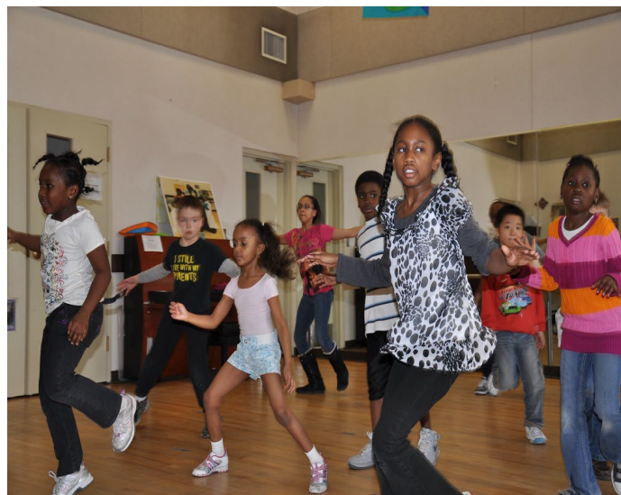
A body in motion will stay in motion

Physics dictates a body in motion will stay in motion. We want kids to always be in forward gear to defend their beliefs. We show how feet carrying the Gospel of Truth are always needed!