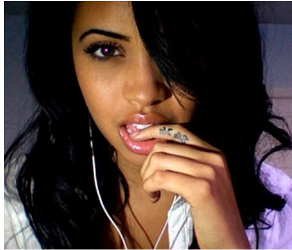
Always be truthful

So many times, lies seem easier, better, and without consequence these days. If kids can't see how the truth profits them, they will lie, that's what makes the armor of God's Belt of Truth so important.